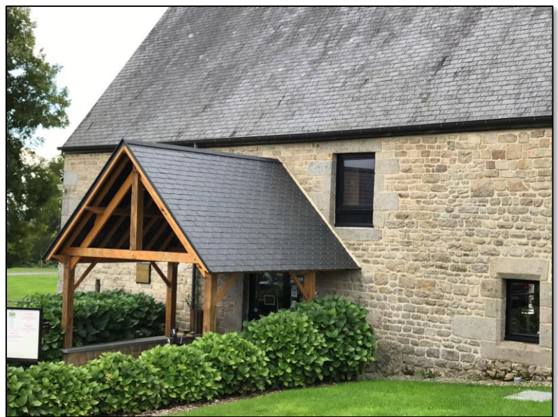
Peter's Golf Clubhouse at Vire in Lower Normandie, France